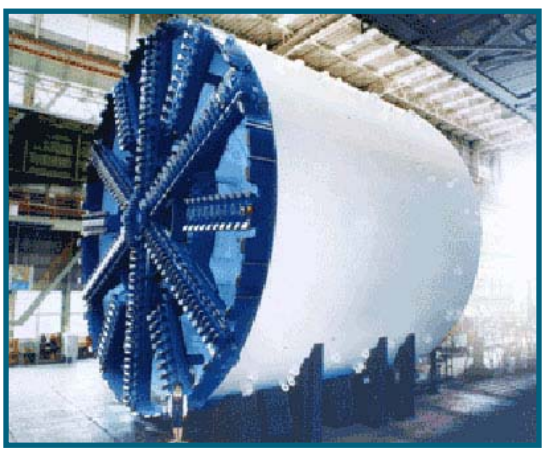
Seven tunnel boring machines will be used in the Madrid Calle 30 project