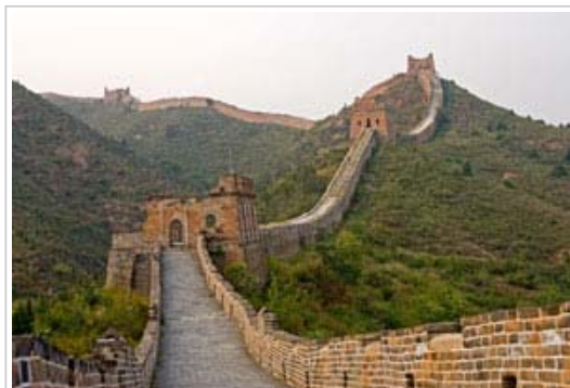
China 2009: Click here for a detailed trip overview (PDF)

While the itinerary emphasizes cultural and historic sites , participants will also visit the economic development zones of Hangzhou and Pudong. They also have the opportunity to attend a reception with representatives of Chinese firms .