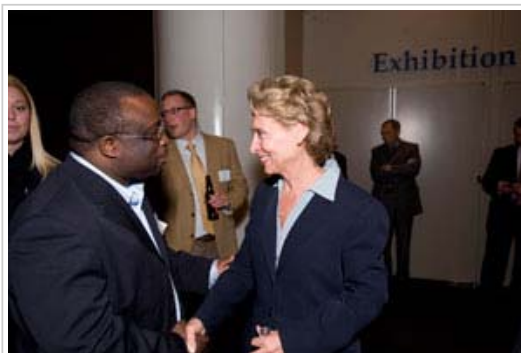
Chamber members talked informally with Governor Gregorie at the December 2008 Public Officials Reception.