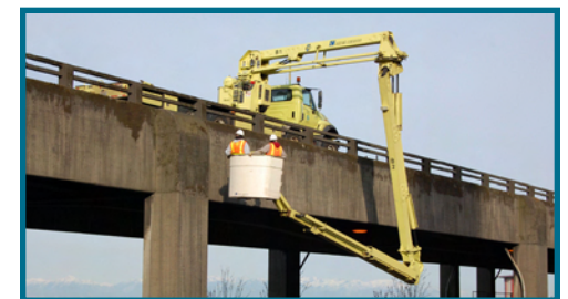
The viaduct is vulnerable to earthquakes and continues to show signs of age and deterioration. It must be replaced.

During 2008, public meetings were held quarterly, more than 50 community briefings were made, and over one thousand public comments were received. These meetings and briefings provided an opportunity for the agencies to gather public feedback on the information as it was being developed.